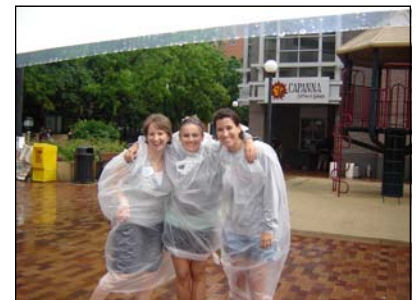
ICARE staff model the latest in rainwear.

Thank you to all of our ICARE Volunteers and Sponsors!