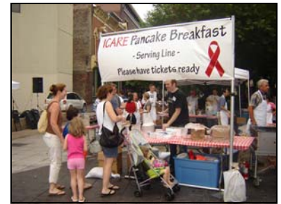
Hungry breakfasters take their place in line.