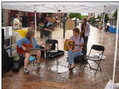
Musicians warming up for the morning's entertainment.